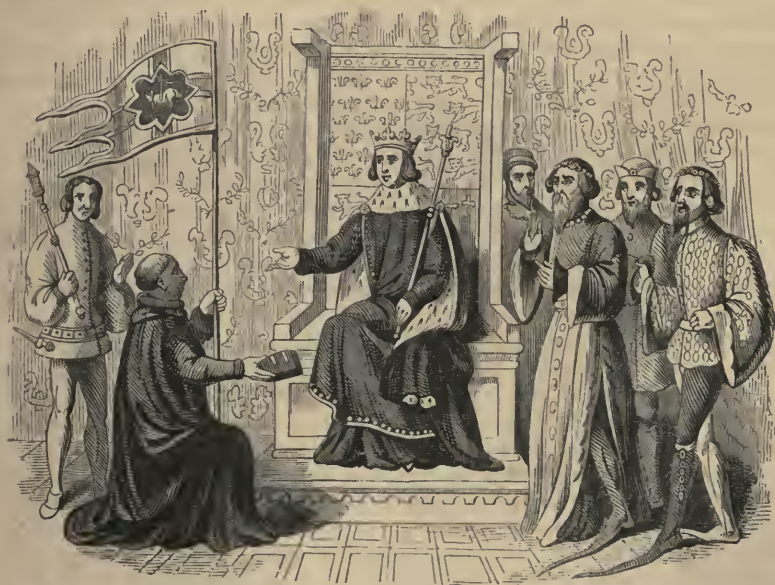
RICHARD II. AND HIS THREE UNCLES THE DUKES OF LANCASTER, YORK AND GLOUCESTER. From an illumination at the head of a most beautiful MS. Epistle, written by an old Monk of the order of the Celestins at Paris on the subject of the peace between France and England, and presented, (as shown by the drawing) by him to Richard. Royal MSS. 20. B. VI.

Sir Thomas Percy, as you have heard, was sent by the king of England to propose a treaty of peace to the court of France, for king Richard was very desirous to accomplish it. Two of his uncles, the dukes of Lancaster and York, were of his opinion; but his other uncle, Thomas of Woodstock, duke of Gloucester, earl of Essex and Buckingham, and constable of England, would no way listen to it; telling his friends secretly, that he would never agree to any peace with France, whatever negotiations might be taken in hand on the subject, if it were not an honourable one; that all the towns, castles and lordships which were yielded to England, but had since been fraudulently taken back, must be restored, and the sum of 1,400,000 francs, which had remained unpaid by the French when they began the war, must also be paid down. He declared, that as long as he lived he should never change these sentiments; in which he was joined by many of the barons of England, particularly the earl of Arundel, who privately said the duke of Gloucester was in the right, though they dissembled their opinions in public from seeing how much the king of England was bent upon peace.